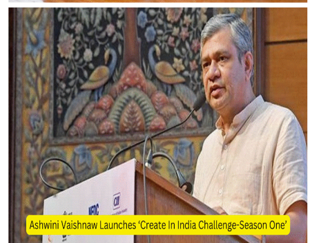
Ashwini Vaishnav Launches 'Create In India Challenge-Season One'

(C) Recently, Information and Broadcasting Minister Ashwini Vaishnav launched Create in India Challenge Season One in New Delhi ahead of the World Audio Visual and Entertainment Summit. Speaking on the occasion, Shri Vaishnav said that 25 challenges have been launched reflecting the growth of the Indian economy and the impact of technological advancements. He said that the media and entertainment industry has also developed, which has given a great boost to the creator economy.